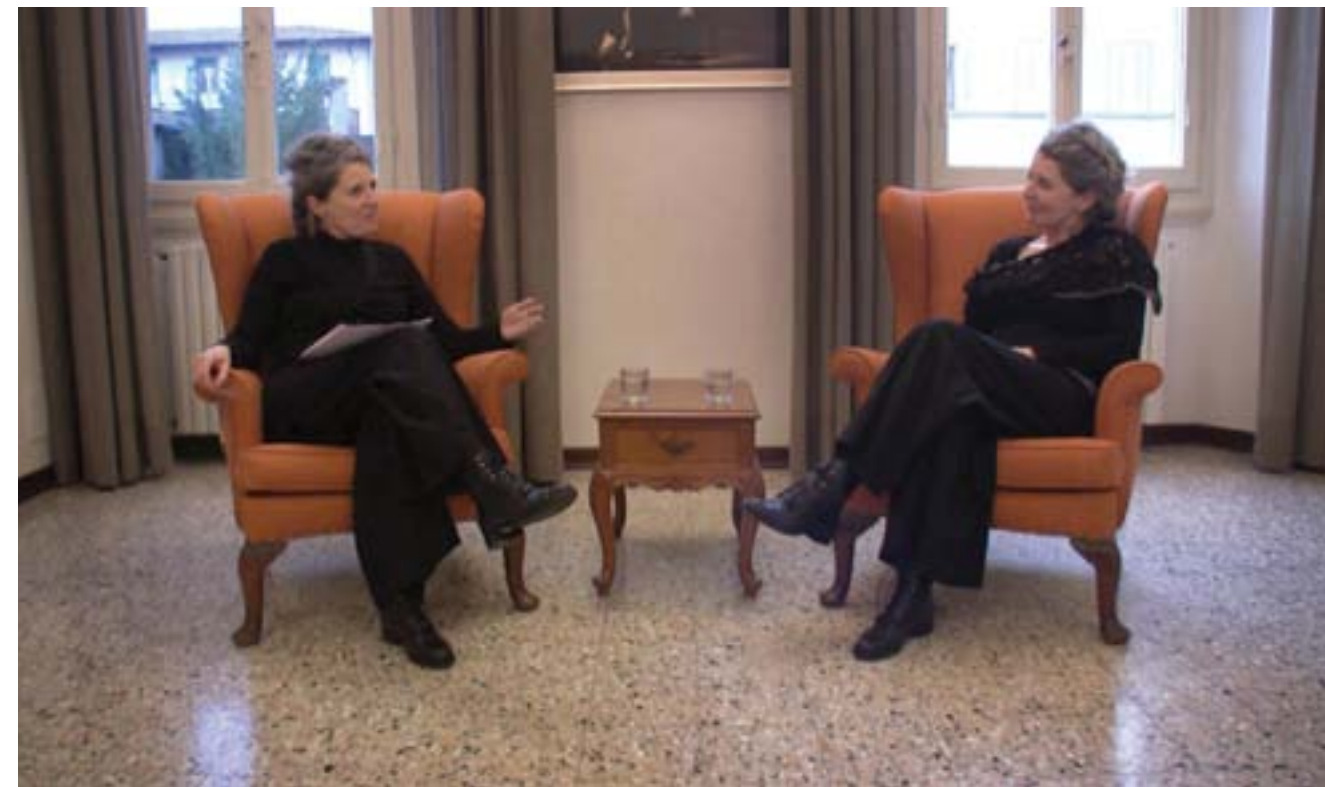
Elizabeth Woods / want to know what Art is, 2011 (detail)